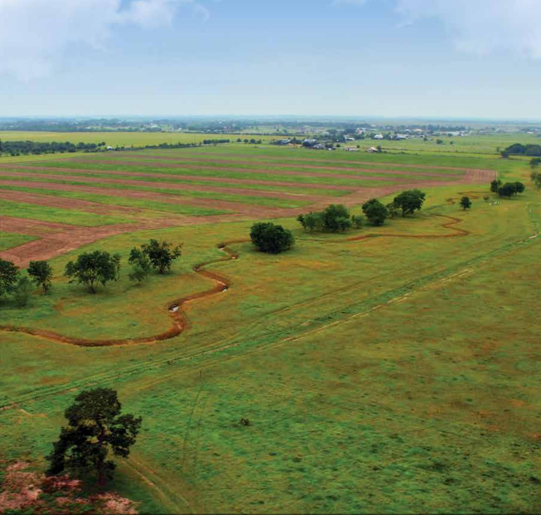
The Katy Prairie Stream Mitigation Bank, Warren Ranch, Harris County, Texas