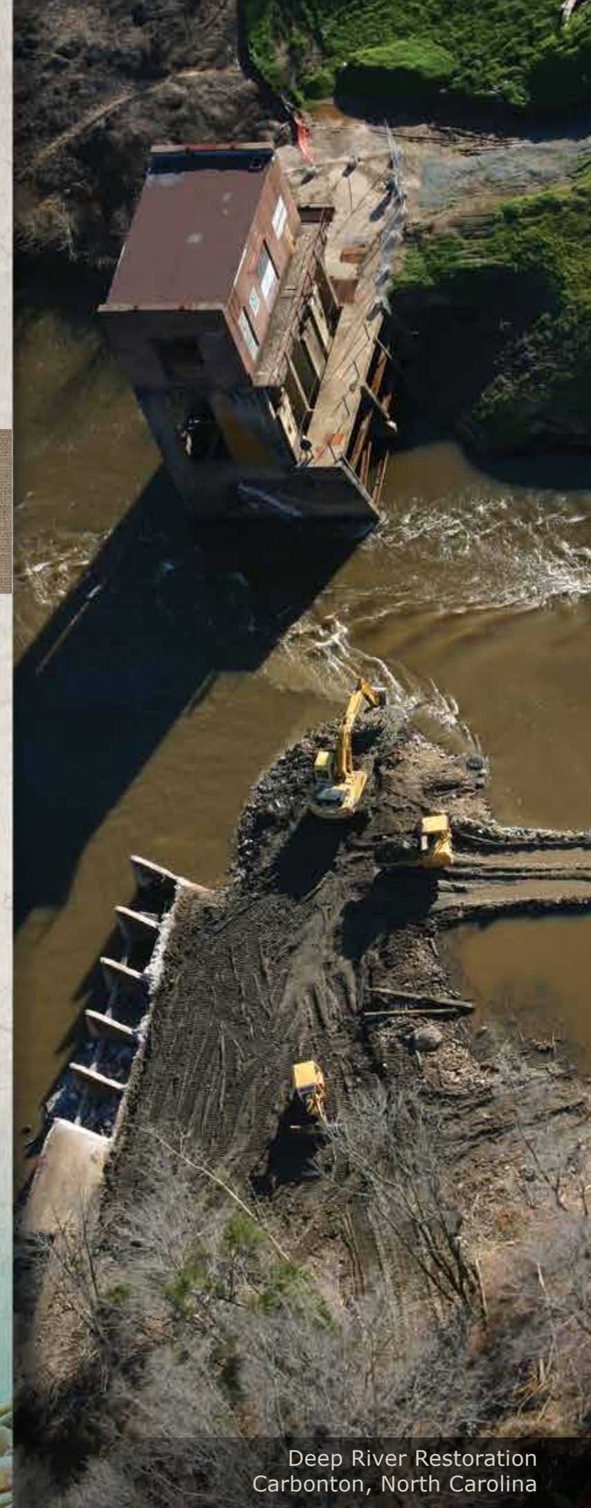
Deep River Restoration Carbonton, North Carolina