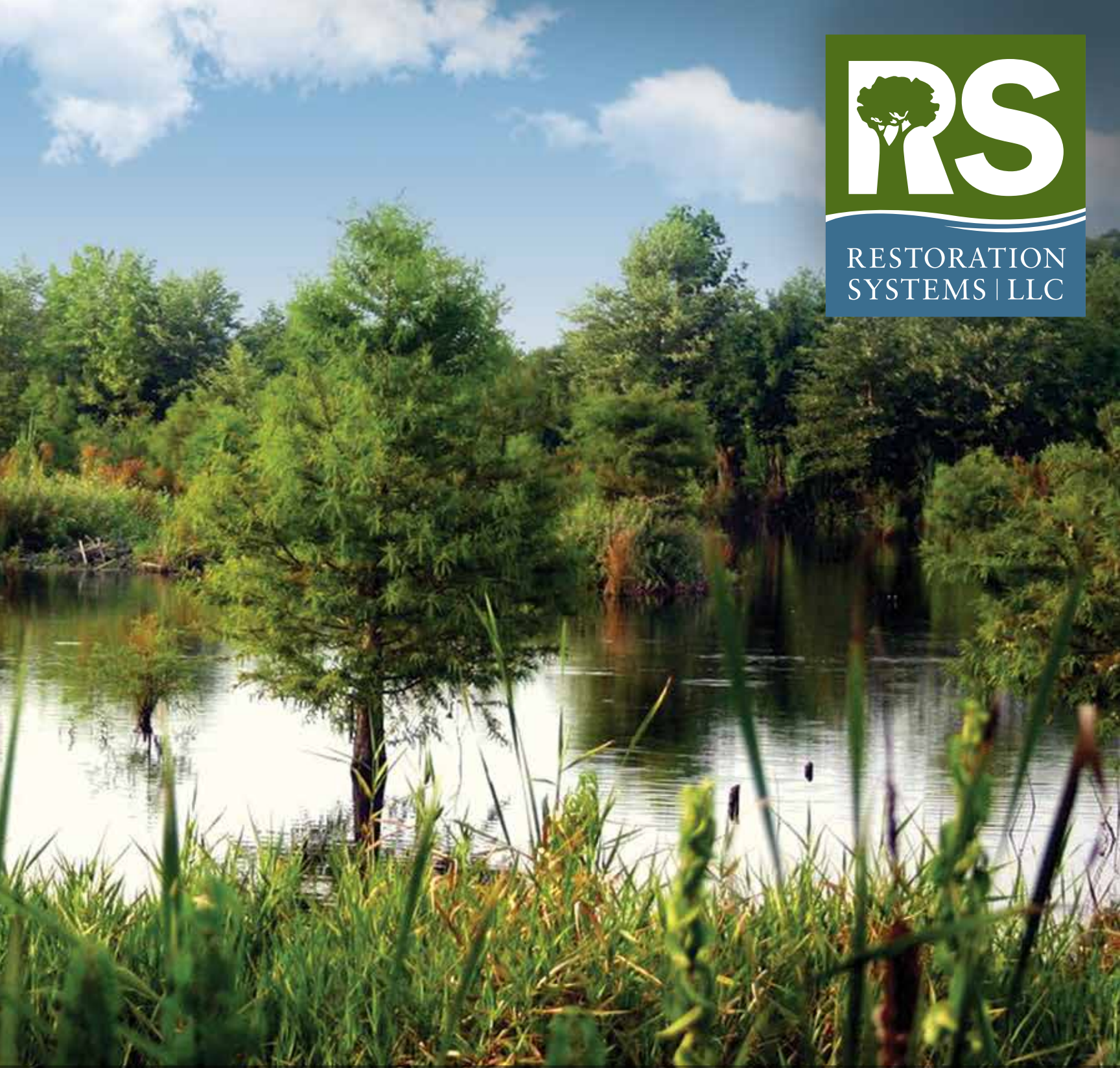
Former cornfield, Bear Creek Wetland Mitigation Bank, LaGrange, North Carolina